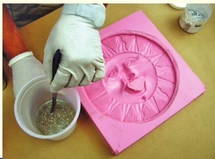
1. Mix Powder