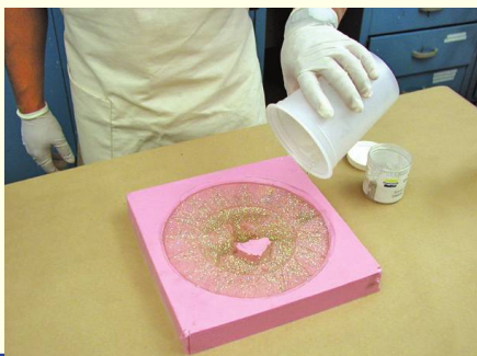
2. Cast Resin