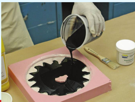
2. Cast Resin