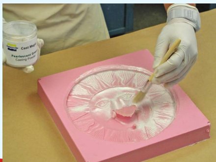
1. Powder Coat